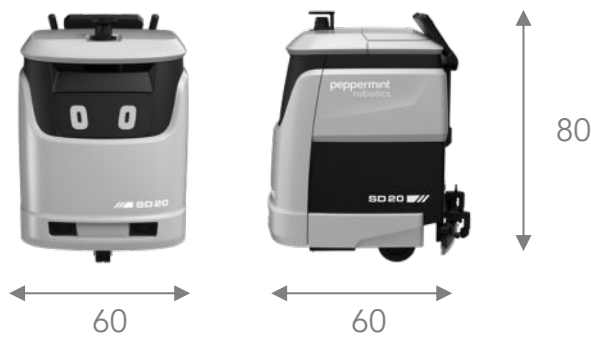
All in cms