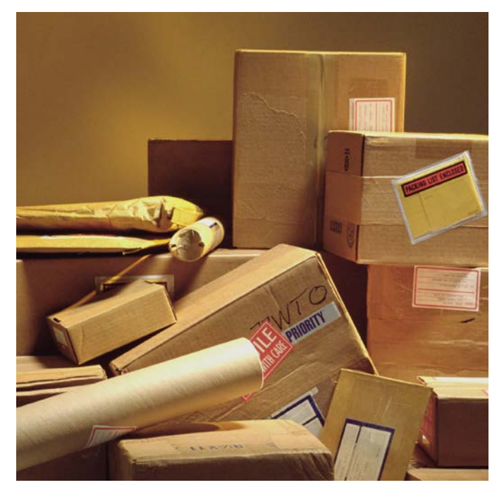
OneSort systems instantly capture dimensions from virtually anything: boxes, flats, documents, poly-wrapped bags, mailing tubes and irregular shapes. It's ideal for exception processing or as a first step to full parcel automation.

Ensure maximum system uptime through real-time insights and predictive analytics that enable our global experts to make informed decisions and quickly resolve performance issues.